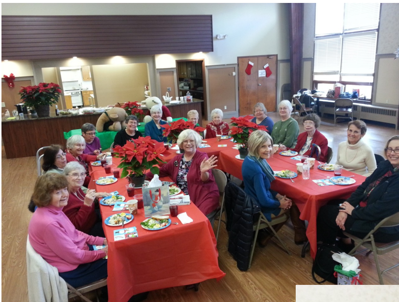
Fairfield Grace United Methodist Women enjoying a Christmas Luncheon gathering on December 17, 2014.